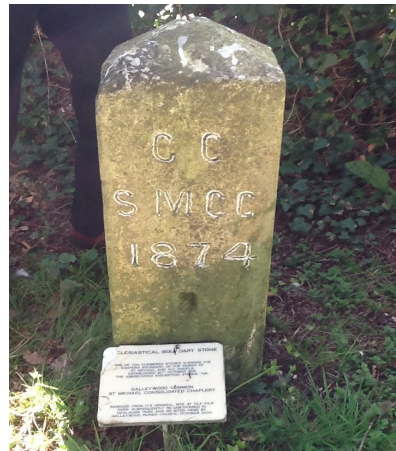
Boundary Stone No 9

St Michael and All Angels Parish was established in 1874. The boundary is marked with 10 numbered stones. Stone No 9 was removed when the Tile Kiln Estate was being developed, initially to Oaklands Park and then in October 2004 the stone was resited at St Michael's Church. There is no record of beating the bounds in Galleywood, however, perhaps a new 'tradition' could be reintroduced as villagers once again find the extent of the Ecclesiastical Parish.