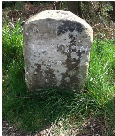
27 Miles to London

A tradition going back to Pagan times, to instil knowledge of tribal boundaries. From medieval times, celebrated at Rogationtide with a pilgrimage around the Parish Boundary.