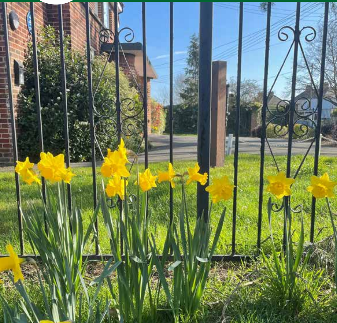
Photo of the Keene Hall