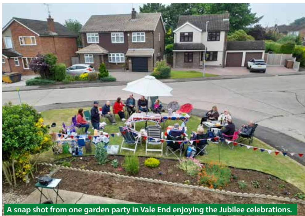
A snap shot from one garden party in Vale End enjoying the Jubilee celebrations.