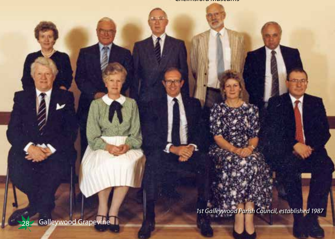
1st Galleywood Parish Council, established 1987