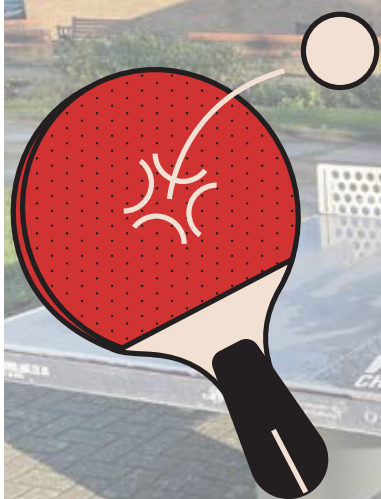
TABLE TENNIS AT WATCHHOUSE SHOPS