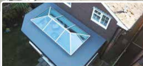
Roof lanterns look great inside and out

High-Tech Roofing have installed over 11,000 flat roofs along with 1500 plus skylights and roof lanterns. Every roof installed comes with a LIFETIME guarantee. Let us, a company you can trust, transform your extension or conservatory into a stunning orangery style room.